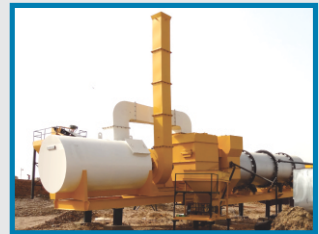
POLLUTION CONTROL UNIT